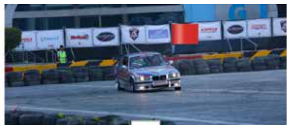
BANNER IN DRIFT AREA - (1.5m width & 1m height) 1500 AED