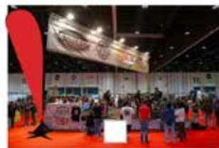
FLAG IN BIKER BUILD OFF AREA 2000 AED