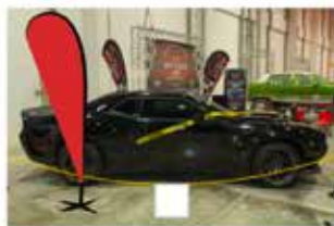
FLAG IN CUSTOM CAR COMPETITION AREA 2000 AED