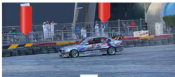
FLAG IN DRIFTING AREA 2000 AED