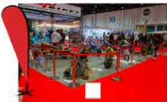
FLAG IN CUSTOM BIKE COMPETITION AREA 2000 AED