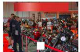
RIGGING POINT - (6m with X 2m height) 8000 AED